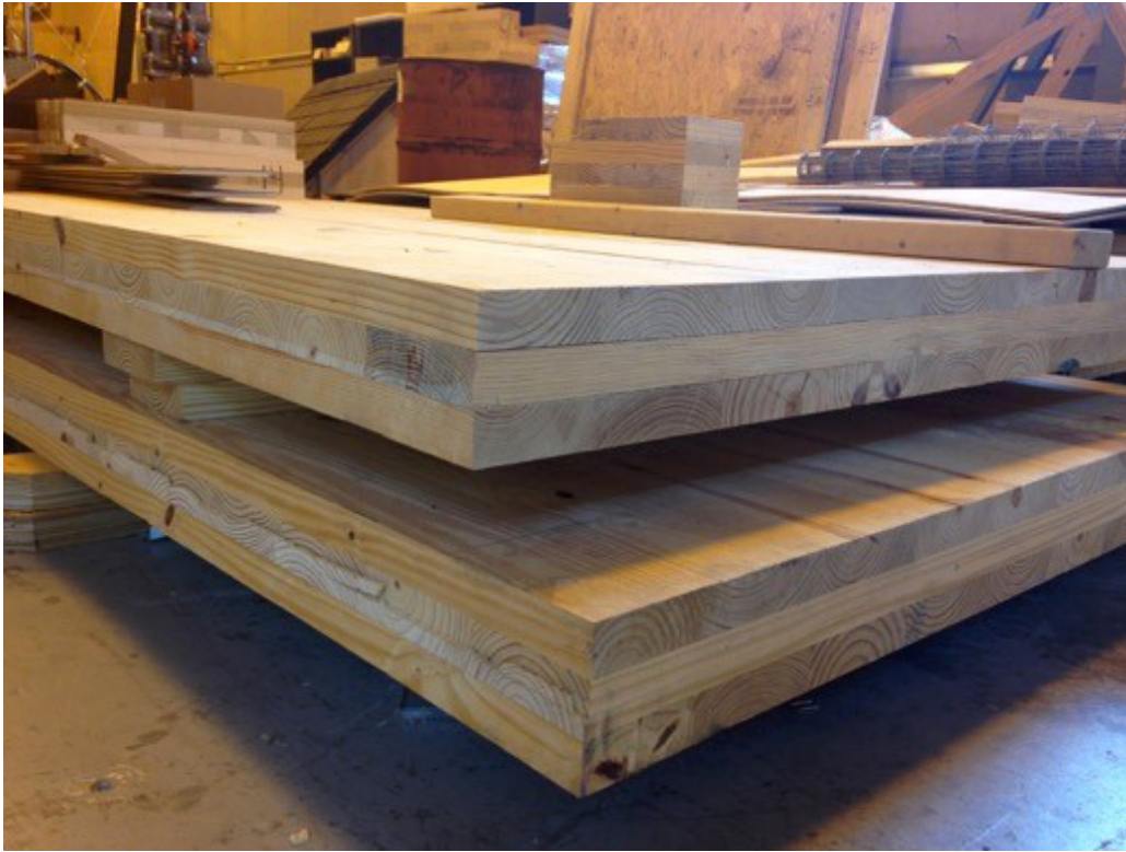
Figure 2. CLT panel made of Southern Yellow Pine (Hindman et al. 2012).

minimum grade lumber in parallel layers should be at a 1200f-12E machine stress rated (MSR) or visual grade No. 2 and in the perpendicular layers should be graded at a minimum No. 3. (APA 2012). Moisture content of the lumber at the time of CLT production should be 12 \pm 3\% . The adhesives used in the manufacturing of CLT panels must meet the requirements of AITC 405 for bonding, strength, and moisture durability (Evans 2014). In addition, adhesives must be evaluated for heat performance in accordance with section 6.1.3.4 of DOC PSI (APA 2012).