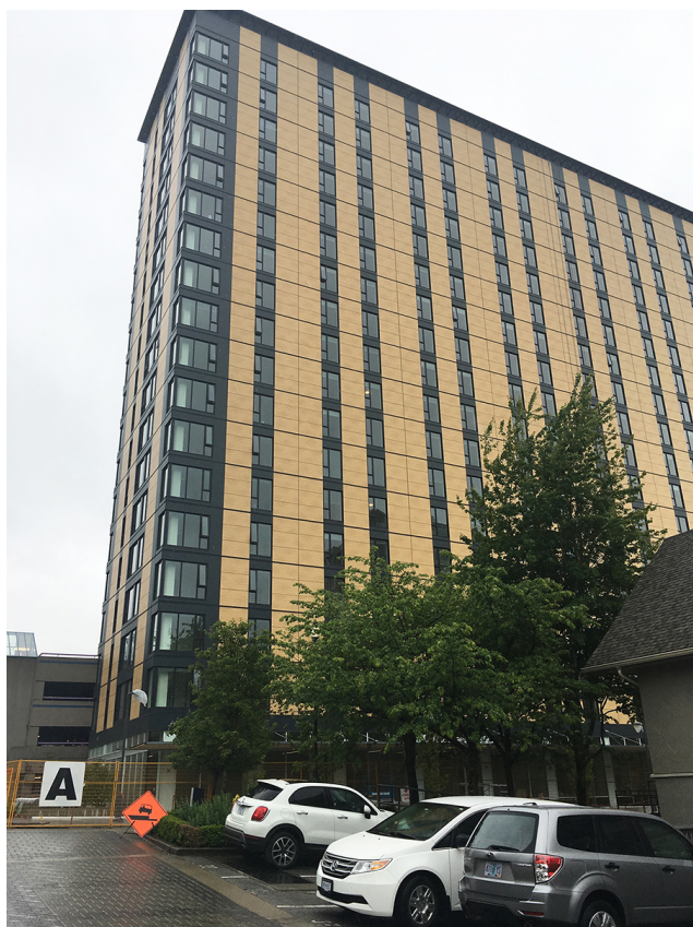
Figure 1. CLT building at the University of British Columbia in Vancouver, Canada.

North America (ThinkWood 2018), with many more in the planning stages. As an example, Figure 1 shows the tallest (18 stories) CLT building in North America on the University of British Columbia campus in Vancouver, Canada, with a cost of CAD$51.5 million.